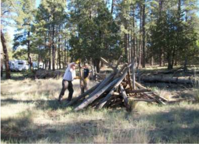
Dismantling old corral and piling for burning