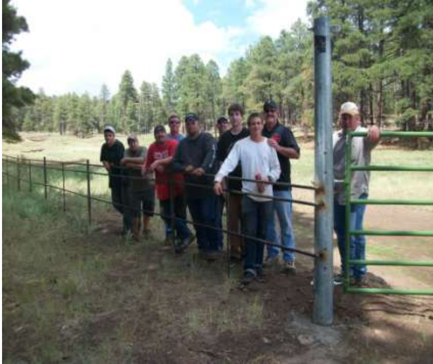
Part of the fence crew admiring the finished product.

Wording for sign to be installed at Powerline Meadow