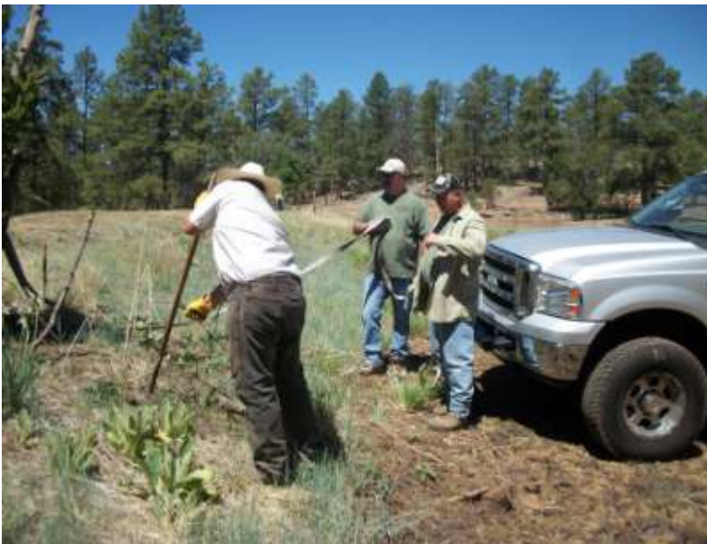
Removing old wire fence