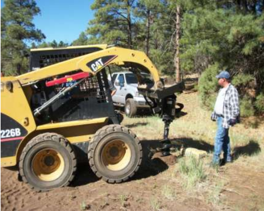
Drilling holes for new pipe fence