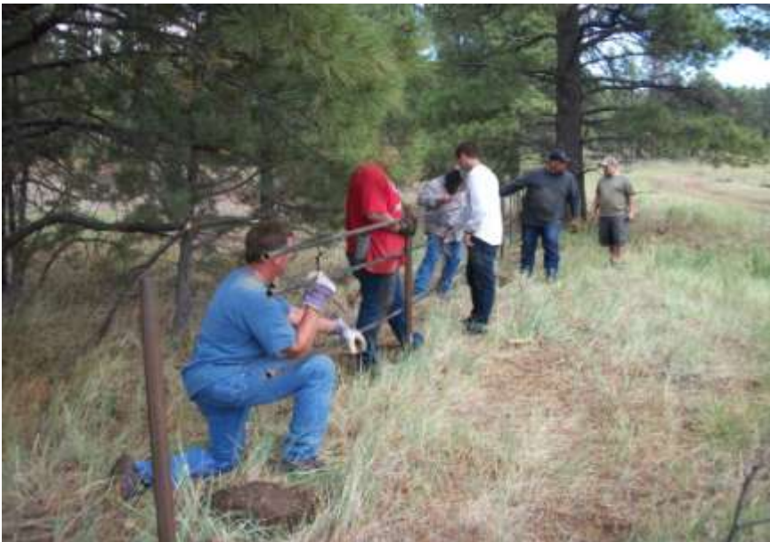
Constructing new pipe fence