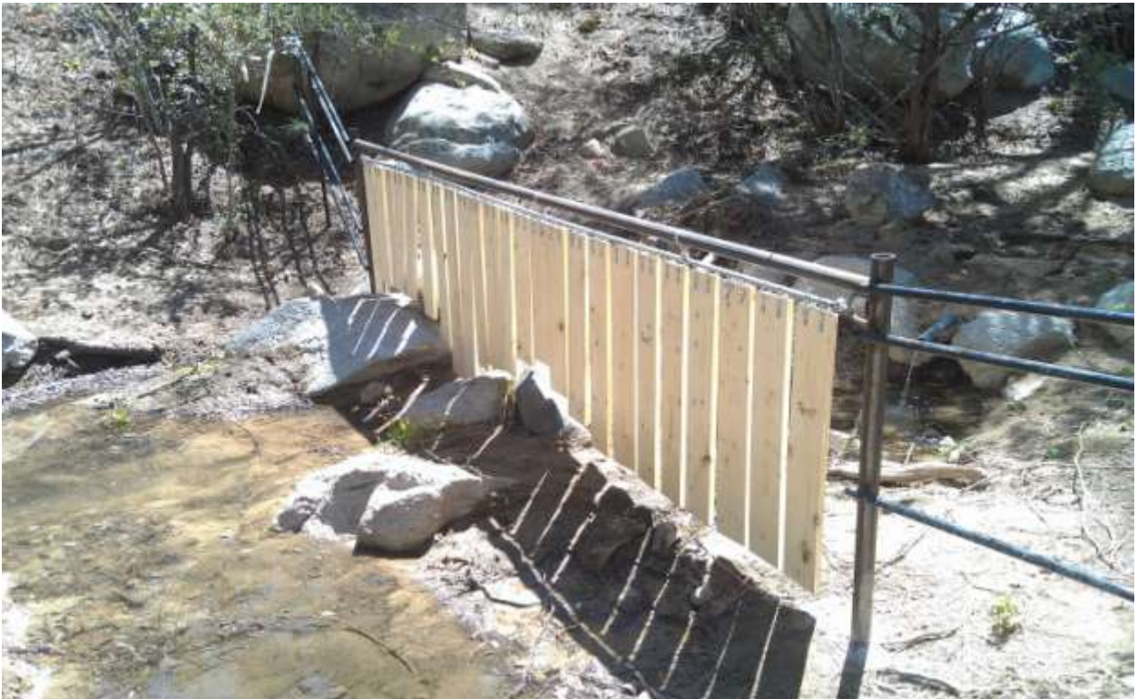
Watergap constructed at lower end of Log Spring