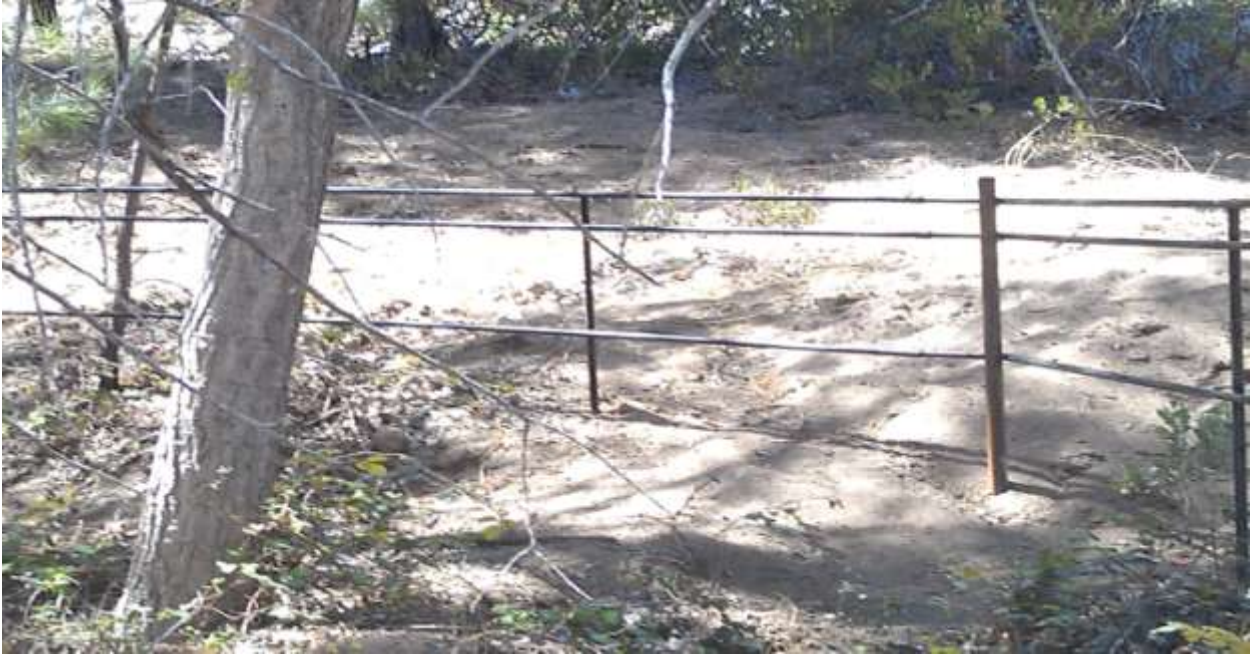
Pipe fence constructed around Log Spring